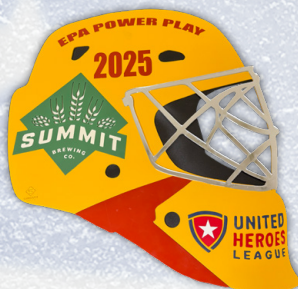
Sawdust Wooden Hockey Mask Sign Great for ON or OFF premise! $55 each 20" x 18"