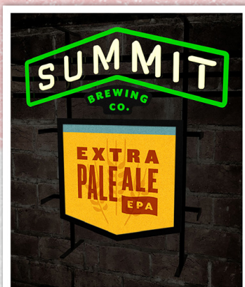
Summit Chevron LEDeon with EPA Badge $135 18.5" x 20.5"