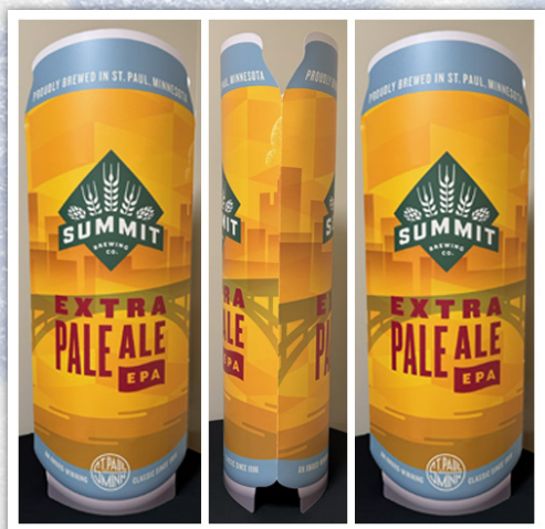
EPA 3D Can Pop Up Display Use for a display enhancer. $118 per carton (10/per carton)

Price changes and orders not meeting minimums will be communicated immediately following closure of the pre-order window.