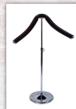
Flexible Shoulder Stand $12 To display Hockey Jersey 21" arm across • 22" round metal base Adjustable Height 18-30"