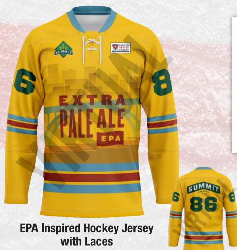
EPA Inspired Hockey Jersey with Laces Make your displays POP! $25