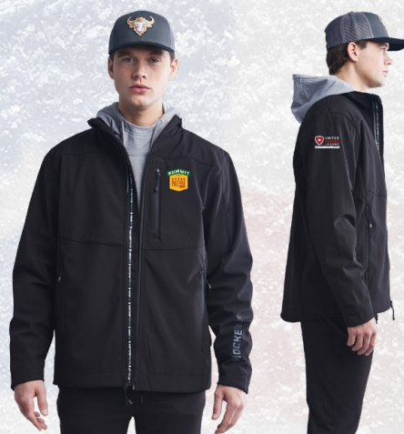
FOR YOUR SALES TEAMS! HockeYak Rink Jacket $50 Sizes: S - 3XL